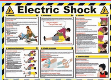
A601T Electric Shock