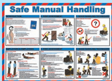
A597T Safe Manual Handling