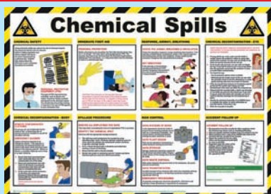
A608T Chemical Spills