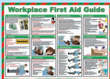
A600TCS Workplace First Aid Guide