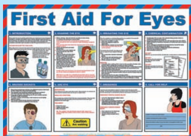
A602TCS First Aid For Eyes