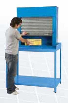
W90013 Mounted on 1200 x 750mm workbench unit